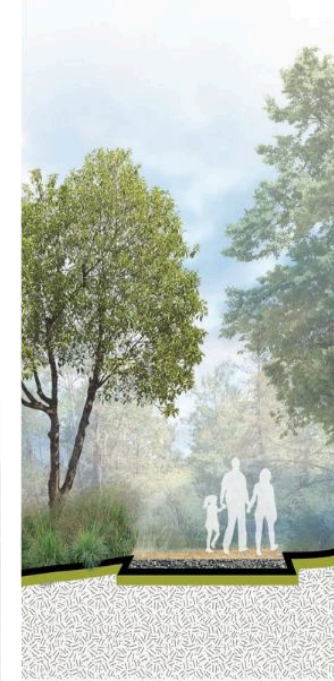
TRAIL CROSS SECTION