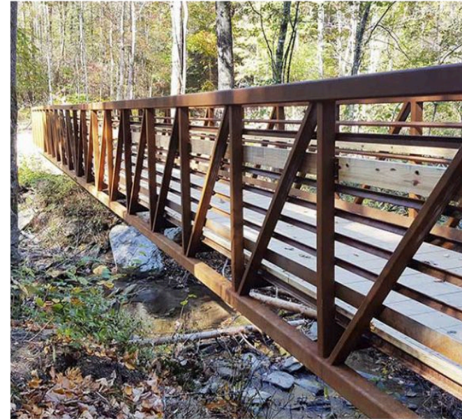
BRIDGE OVER SILVER LEAD CREEK